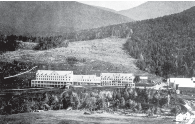
Fig. 6. Advertisement and Photograph of Glen House, 1879. The advertisement illustrates the extent to which the region promoted itself exclusively to hay fever sufferers—but the adjacent farm, referred to in the advertisement, and extensive clear-cutting, evident in the photograph, were two activities that hay feverites believed threatened the place as a hay fever refuge.

“The largest and most desirably located House in the region, and the only one where from every window of its four hundred feet front, and its broad piazza (extending to double its former width), the highest mountains in New Hampshire are distinctly seen from base to summit, viz., Mts. Washington, Jefferson, Adams, Madison, &or. A sure relief is here obtained for catarrhal complaints, hay fever and rose cold. A large Farm from which vegetables are obtained, and a fine Dairy. Its Cuisine will compare favorably with the best Hotels in the United States. The “Glen” is reached from Gorham, N.H., on the Grand Trunk Road by eight miles staging, from the Glen Station on the Portland and Ogdensburg Road fifteen miles; from the Mount Washington R.R., eight miles.”