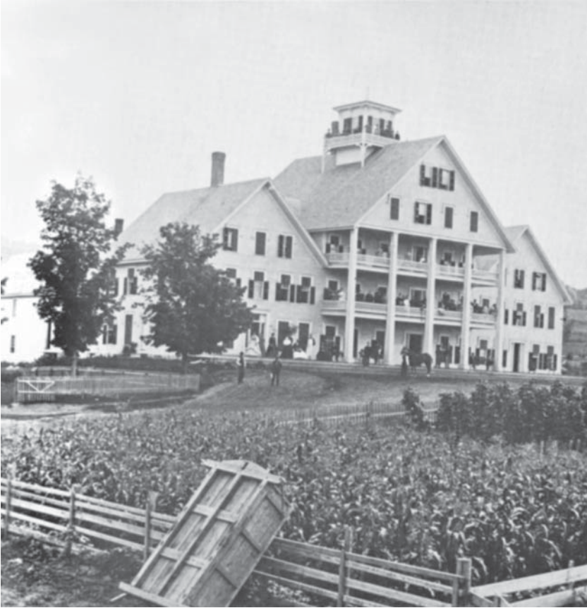
Fig. 5. Sinclair House, 1870s. The presence of vegetable gardens, like this one in front of Sinclair House, a popular meeting place for the United States Hay Fever Association, became of increasing concern to Bethlehem's seasonal residents.