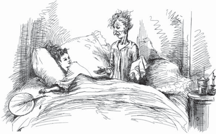
I. At midnight, on the 19th of August, Mr. A. Wiper Weeps is awakened with an irritation of the eyes, and remarks to Mrs. Weeps that he "feels it coming on."