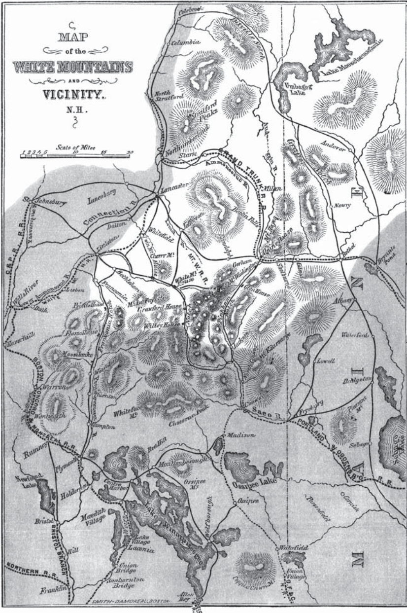
Fig. 3. Morrill Wyman's Map of the White Mountains. This map illustrates the microgeography of exempt places: the gray shaded areas offered no refuge; only in the white region did hay feverites find escape from their dreaded disease.