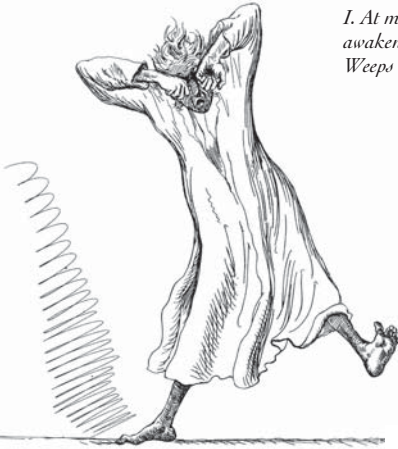
II. Whereupon he jumps out of bed, and grinds his eyes with both his fists.