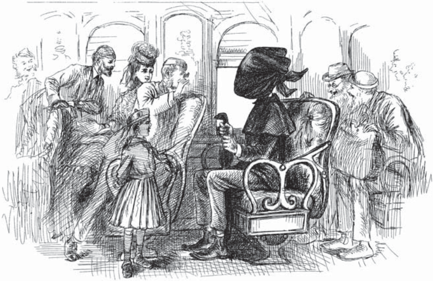
IX. The railway dust "sets him wild:" so Mr. Weeps arranges himself for the journey, and becomes an object of curiosity to his fellow-travellers.